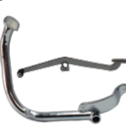
BRAKE & GEAR PEDAL