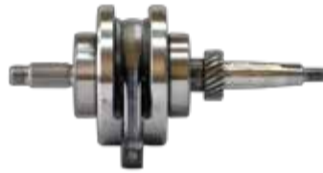
CRANK SHAFT ASSY