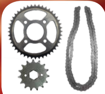
CHAIN & SPROCKET