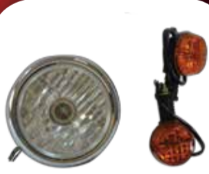
HEAD LAMP & INDICATOR SET