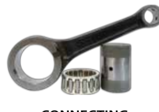
CONNECTING ROD KIT