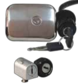
COMPLETE KEY & LOCK