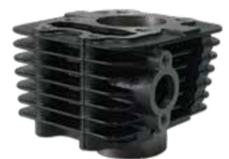
ENGINE BLOCK ASSY